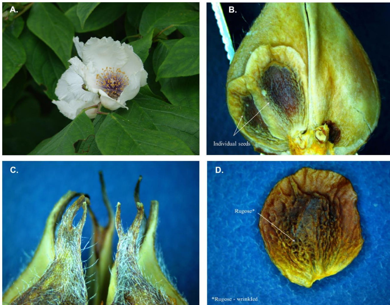
Figure 3. Stewartia ovata . (A). Flower; (B) Capsule with seeds; (C) Capsule with forked locule apex (persistent styles); (D) Seed.

tree. Both species have rather ordinary bark in comparison to the multicolored, papery, and exfoliating bark of many Asian species such as S. monadelpha and S. pseudocamellia . Some degree of hybridization appears to be possible within Stewartia , for example S. pseudocamellia has been crossed with both S. monadelpha and S. ovata . Nevertheless, S. malacodendron remains a phylogenetic outlier, distantly related to all the other deciduous taxa (Lin et al., 2019). The subtropical evergreen cohort of Stewartia (formerly known as Hartia ) are in fact nested between S. malacodendron and all other species.