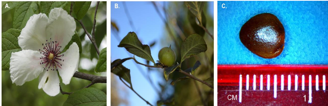
Figure 2. Stewartia malacodendron . (A). Flower; (B) Capsule; (C) Seed.

http://www.pollyhillarboretum.org/plants/stewartias-2/stewartia-malacodendron/